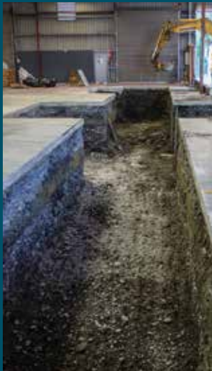
1 A simple digout, even through cut concrete.

<< Featuring vents this pit is ready for installation.