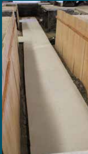
2 Concrete slab bed poured ready for the installation.