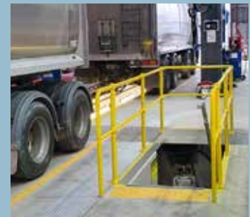
Stairwells, handrails and easy access tunnels designed to your requirements.

Take advantage of professional planners and engineers who can help you and guide you through planning your next pit from top to bottom - even right down to building consents and project management.