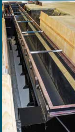
3 Final placement of the assembled pit on the slab.