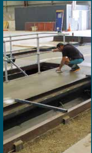
4 Backfilled and floor cement finish render.