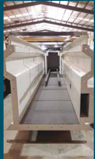
Durable Finished Surface.

Designed and fitted with exactly the components you require.