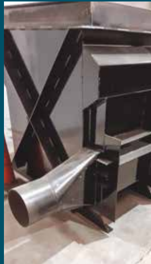
Ducted Ventilation System.

Assuring long lasting, hard wearing, super low maintenance & safety.