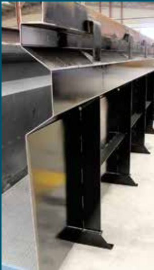
Steel with Precision Construction.

Built from mild steel, cut, folded and MIG welded with precision. Walkway tunnels, access stairs with handrails and much more - customised for you.