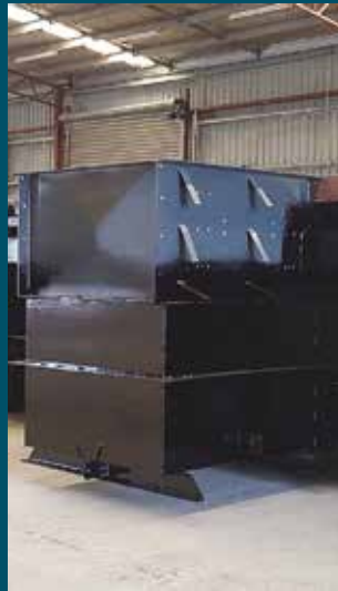
Brake Testing Unit Accessory.

Worker safety - pump out gases and fumes.